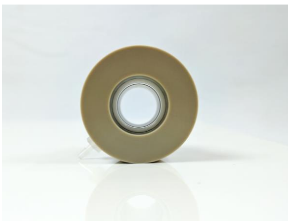
Figure 1. Gas-Purged Bearing Assembly