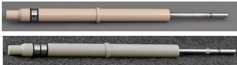
Figure 3. Precision 15 mm Single and Double RCE Shafts for MSR Rotators