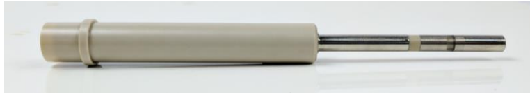
Figure 2. Precision 15 mm RDE/RRDE Shaft for MSR Rotators

The Gas-Purged Bearing Assembly is compatible with precision-machined 15 mm OD shafts. Pine Research Instrumentation manufactures three such shafts: the RDE/RRDE Shaft for MSR Rotators (part #: AFE6MB), the Single RCE Shaft for MSR Rotators (part #: AFE9MBA), and the Double RCE Shaft for MSR Rotators (part #: AFE9MBDA). The RDE/RRDE shaft is used for rotating disk electrode (RDE) and rotating ring-disk electrode (RRDE) experiments and accommodates a variety of electrode tips (see: Figure 2). The Single and Double RCE shafts are used for rotating cylinder experiments (RCE) and accept 15 mm OD cylinder inserts (see: Figure 3). All three shafts have a stainless steel rod for connection to the electrode tip/insert and a retaining ring to keep the bearing assembly in place.