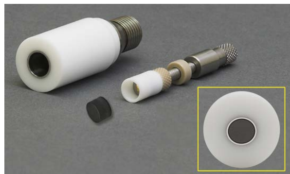
Figure 1. Changedisk Rotating Ring-Disk Electrode.

For over four decades, Pine Research has provided electrochemical researchers with a reliable line of rotating electrode products. Both our rotating disk (RDE) and rotating ring-disk (RRDE) electrodes (see: Figure 1) have proven to be quite popular tools for probing electrocatalyst behavior. This technical note assimilates much of the practical feedback that we have received from fuel cell researchers who use our products to screen electrocatalysts.