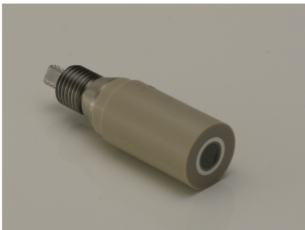
Figure 4. RRDE Tip for Use up to 80 Degrees C.

While theoretical equations for computing the collection efficiency are available, it is always best to empirically measure the collection efficiency of a specific RRDE before using it for any quantitative work. This is normally done using a well-behaved electrochemical system such as the ruthenium hexamine redox couple. This system can be used to measure a stable collection efficiency at rates between 200 and 2500 RPM . The reader is referred to the appropriate reference 6 for more details.