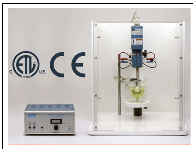
Figure 2. Pine Research MSR Electrode Rotator.

Particular attention is paid to techniques involving the immobilization of thin ORR electrocatalyst films on glassy carbon RDEs and RRDEs. A bibliography of related research publications is also provided.